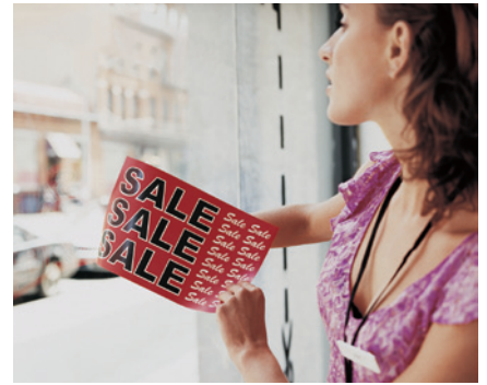
Xerox® NeverTear Window Signs

With our special polyester EA Low Melt Toner, the output fuses to polyester in a chemically bonding way, ensuring outstanding image quality on specialty substrates such as polyester and more – allowing you to offer a broader set of media choices. Premium NeverTear is water, oil, grease and tear resistant.